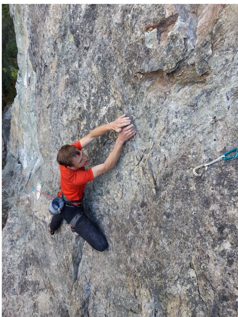
Bunsen Burner 5.10d