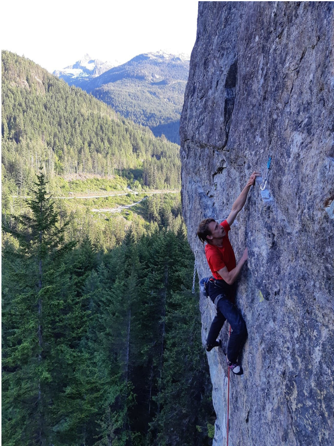
Lab Rat 5.12a