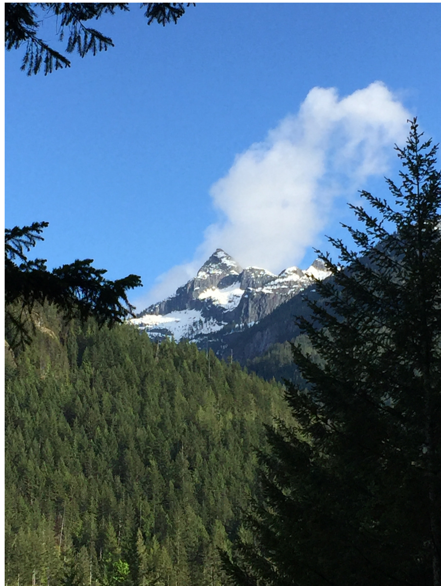
Views of Habrich from the base of the cliff

Trailhead: https://www.google.com/maps/place/49.7109404,-123.1015617