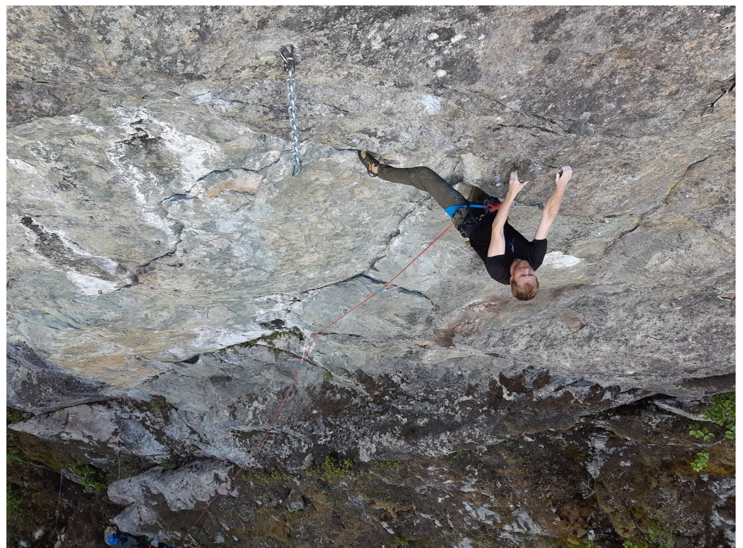
Lab Rat 5.12a