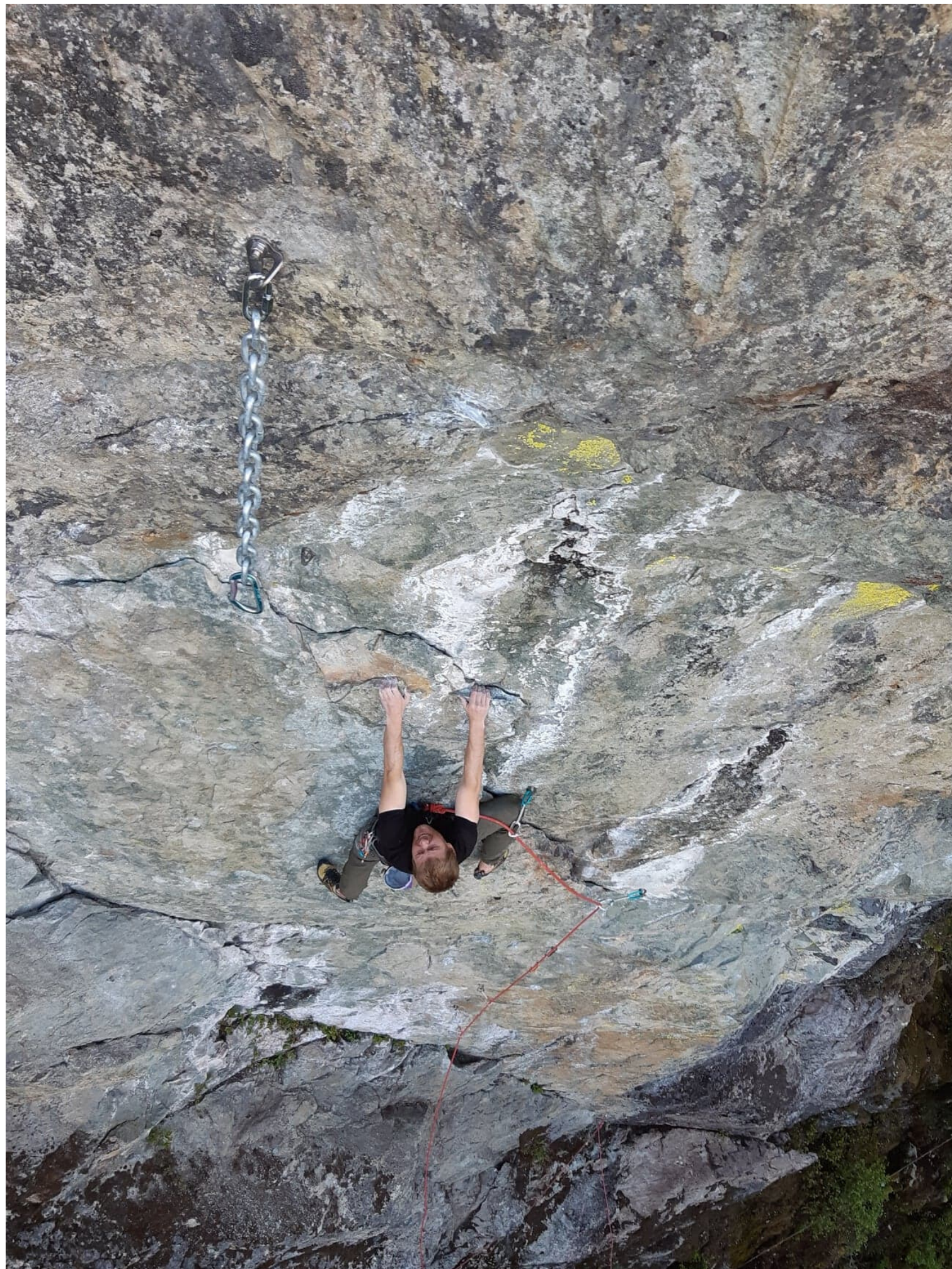
Occam's Razor 5.12c