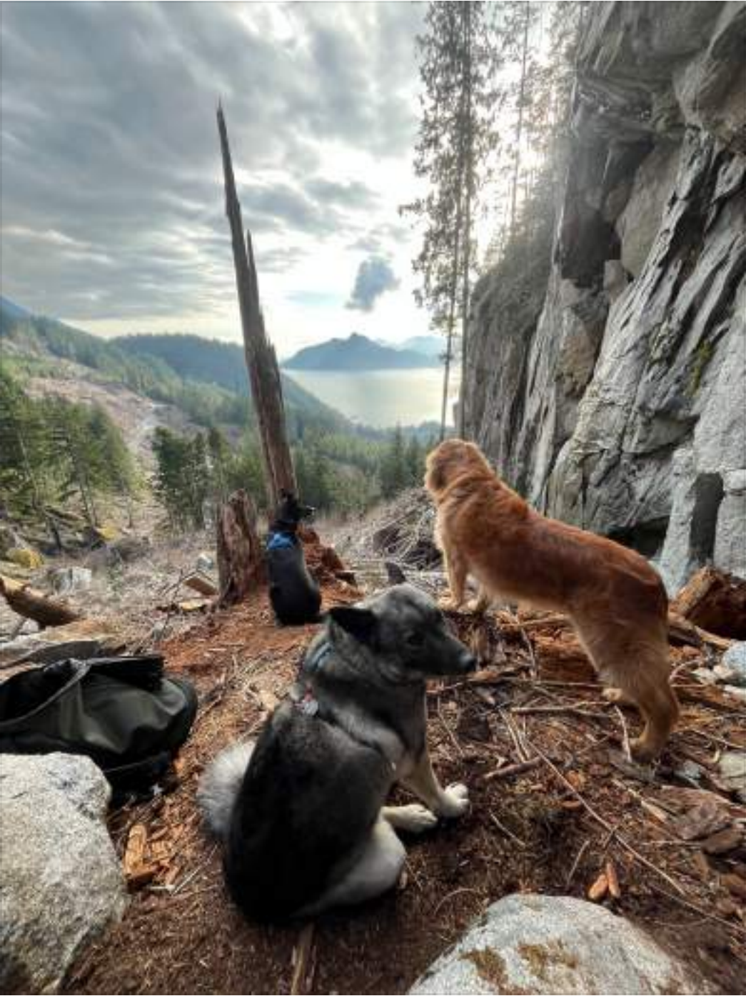
Another day at the Furry Temple