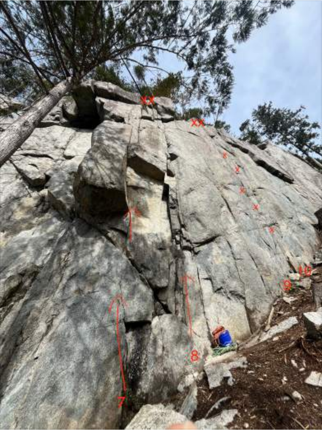
9. Photosynthesis 11b/c 17m 5 bolts optional hand sized piece. Techy cracks and edges FA Colin Moorhead Oct 2023